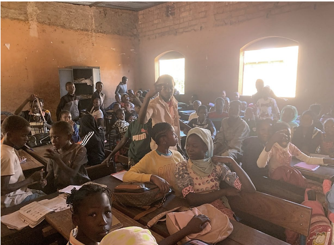
classroom in a public school, city of Kati, November 2023