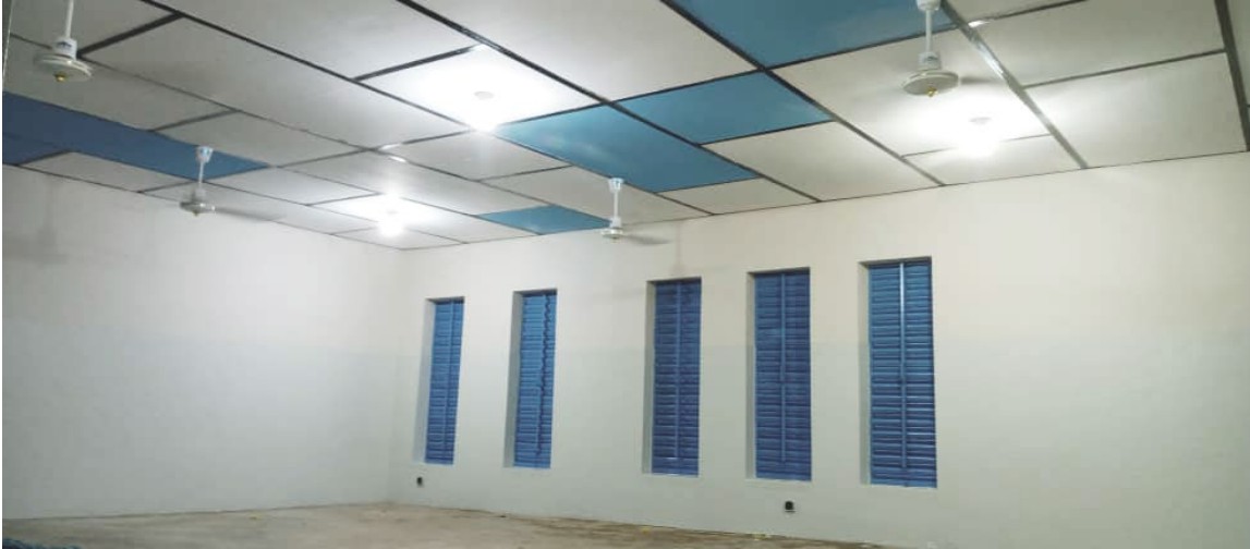
classroom in Djamballa